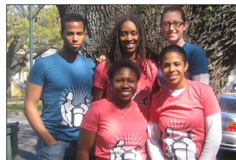
Howard University Students, Spring Break 2008

Louisiana's environmental health and justice movement can always use new energy. Our new Environmental Justice Corps targets students at the region's Historically Black Colleges and Universities. In the summer of 2009 the LABB will host 15 HBCU students, each of whom will specialize in a track: Media, Organizing, Public Health, Law, Fundraising, Sustainable Energy, or African-American History.